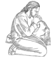
TEACH US TO PRAY